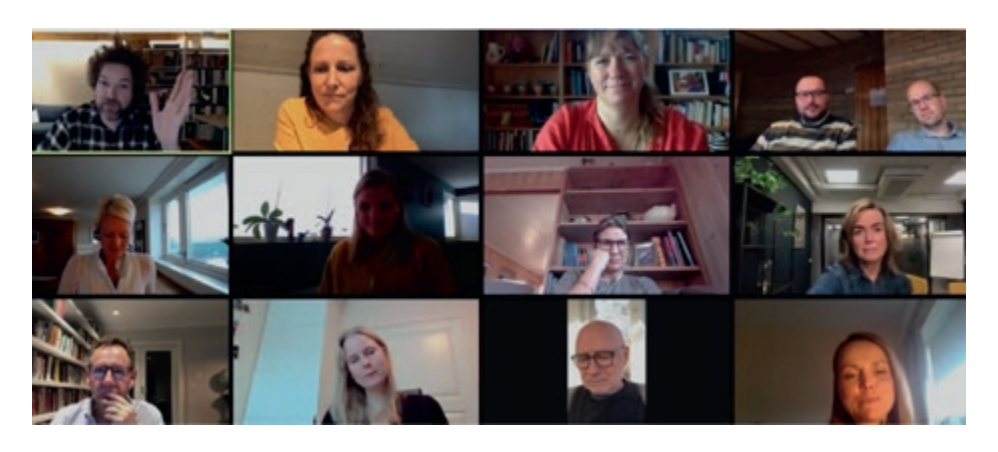
The COVCOM project is designed to run during a pandemic, and focuses on digital research collaboration. Screenshot from the COVCOM kick-off on Teams in November 2020.

3. Test the effect of this communication in controlled studies (RCTs). This is a quantitative study, where various communicative choices are assessed in terms of learning, attitude and behavior change, and so on.