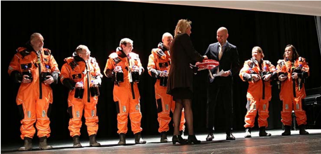
From the official opening back in 2014.