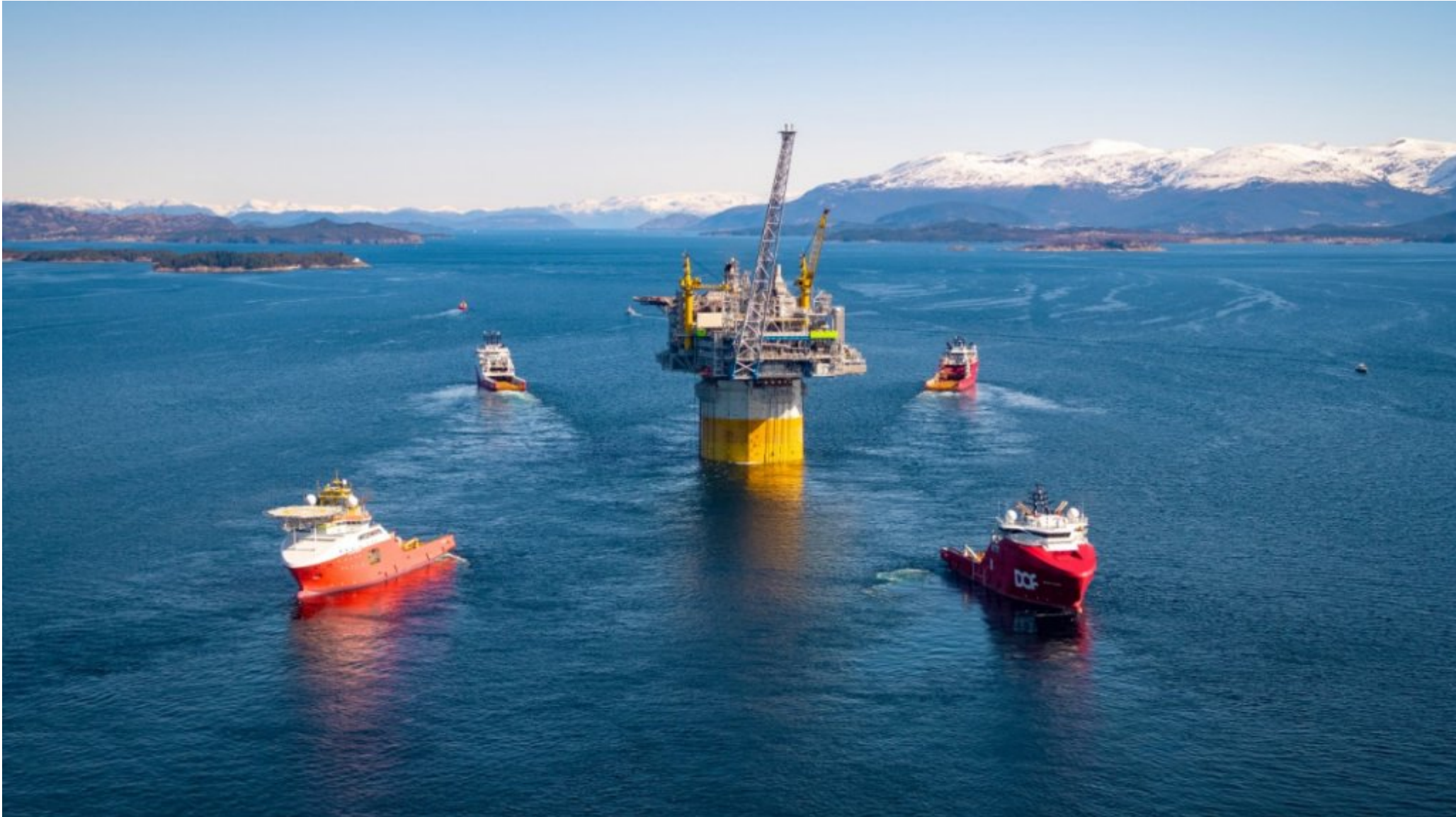
The tow-out of the Aasta Hansteen platform from Stord to the Norwegian Sea began on April 12.