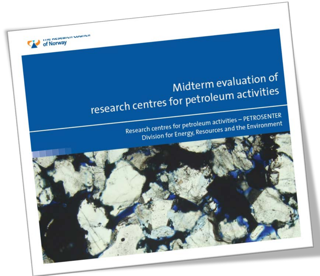
Excellent results in the midterm evaluation.